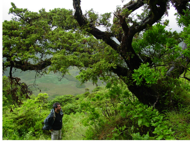
Juniperus brevifolia habitat at Faial, Azores.