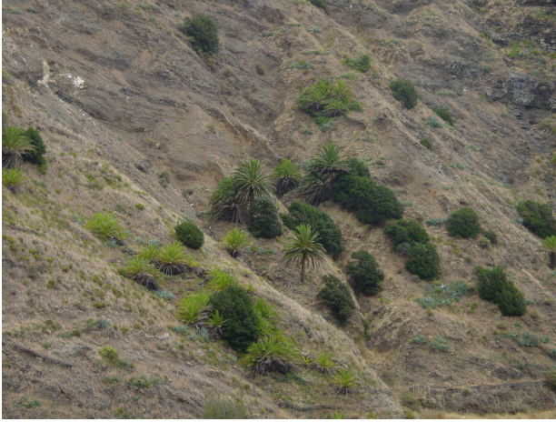
Juniperus turbinata subsp. canariensis habitat at La Gomera, Canary Islands (Photo: Jorge Capelo).