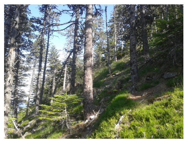
Fir woodland with Vaccinium myrtillus, Sphagnum quinquefarium and Listera cordata on a north slope of southern Massif central, France.