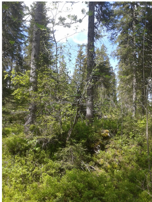
Fir stand on limestone pavement, Risoux forest, French Jura, France.