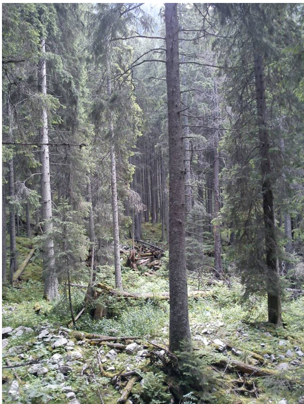
Fir virgin forest in Gemelele scientific reserve, Retezat National Park, Carpathian Mountains, Romania.