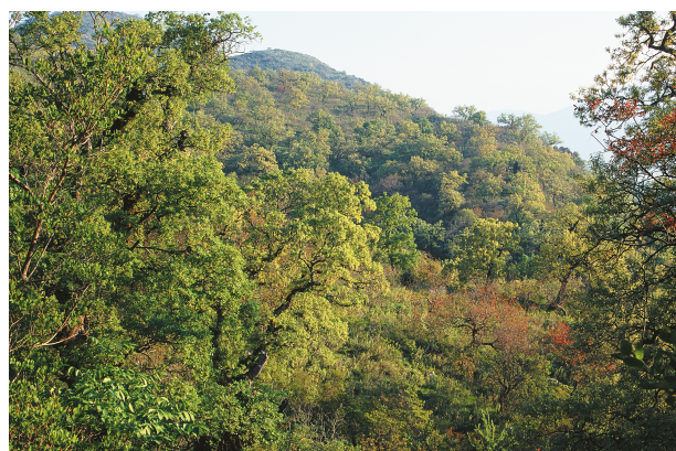
Quercus ithaburensis subsp. macrolepis stand at a closer view in the most extensive