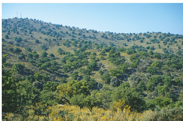
Quercus ithaburensis subsp. macrolepis open woodlands at the most extensive

G1.7b Mediterranean thermophilous deciduous woodland