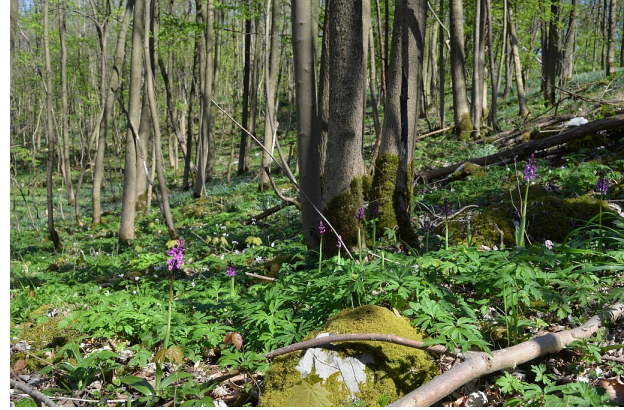
G1.6a Coppice form of beech forest with Anemone nemorosa and Orchis mascula in the herb layer Dal van de Hohn, Belgium.