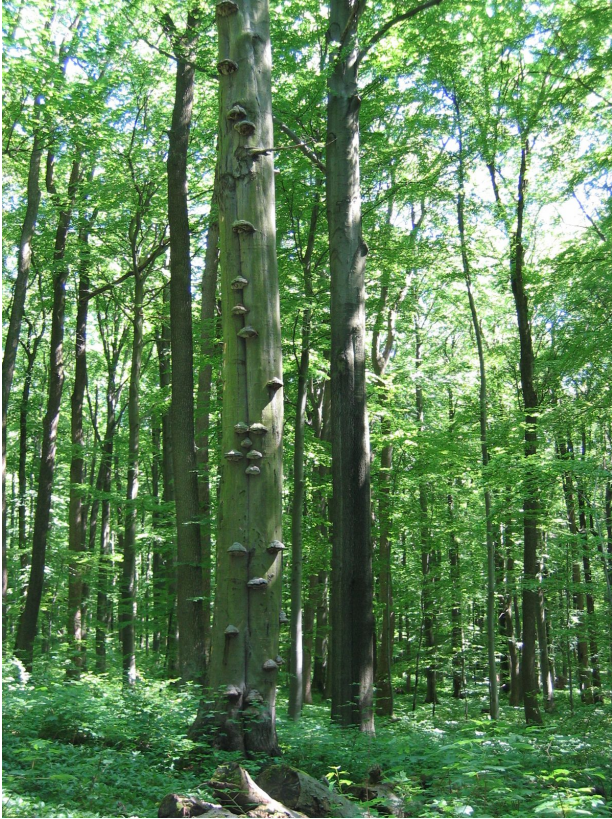
G1.6a Fagus woodland on non-acid soils in the National Park Hainich, Germany.