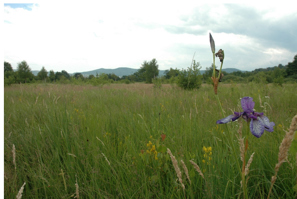
Wet oligotrophic grassland community of the 'Molinion' with Iris sibirica in Transylvania, Romania (Photo: John Janssen).