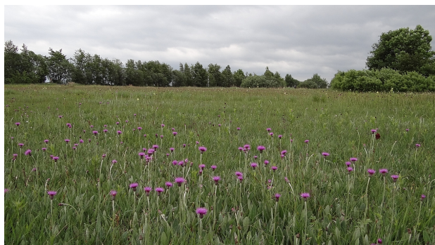
In the western distribution range of this habitat type, Cirsium dissectum is a striking species, as here in the Natura 2000 site 'Oldematen en Veerslootlanden' in the Netherlands.

E3.5 Temperate and boreal moist or wet oligotrophic grassland