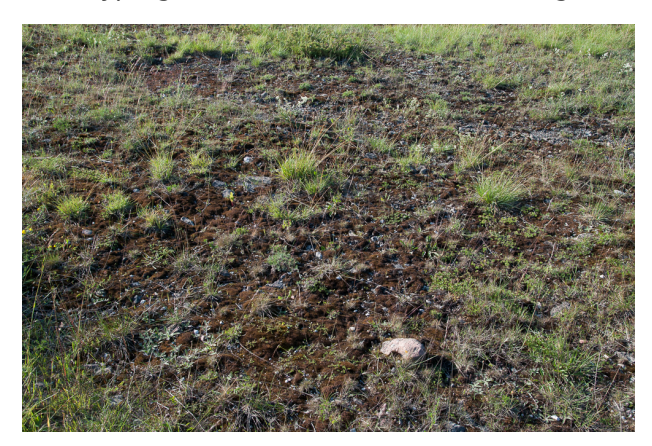
Stand of the Crepido pumilae-Allietum alvarensis (alliance: Tortello tortuosae-Sedion albi) over pre-Cambrian flatrock (alvar) on the island of Saaremaa, Estonia.

E1.1d Cryptogam- and annual-dominated vegetation on calcareous and ultramafic rock outcrops