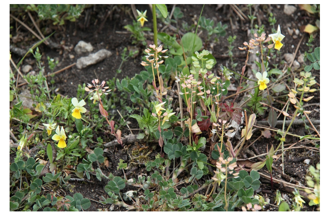
Close-up of the alliance Alysso alyssoidis-Sedion with the vernal annuals Thlaspi perfoliatum, Arenaria serpyllifolia and Viola tricolor on an eroded limestone slope near Klentnice, SE Czech Republic.