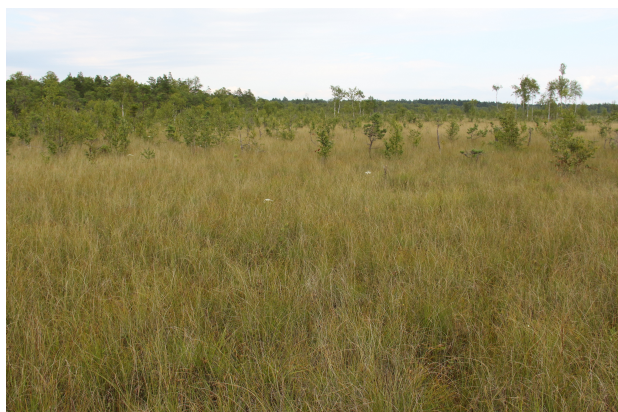
Tall-sedge base-rich fen with Carex lasiocarpa , C. limosa , C. panicea , C.