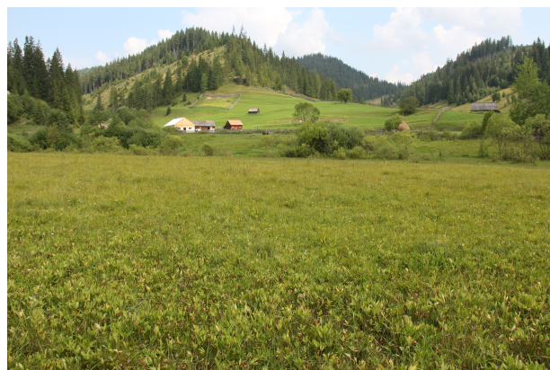
Tall-sedge base-rich fen with Carex diandra , C. rostrata , C. limosa , C. dioica ,