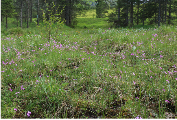
Spring aspect of a spring-fed short-sedge fen close to Ulreichsberg, Austria (the Alps). Primula farinosa characterises mountain short-sedge fens in the Alps and Carpathians that are rich in habitat specialists. (Photo: Petra Hájková).