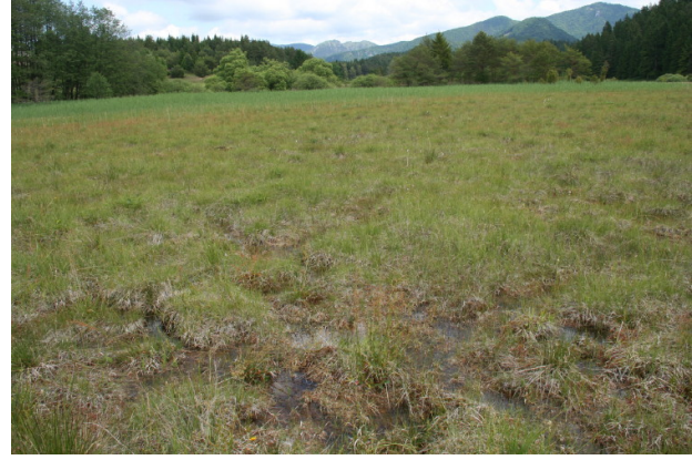
Short-sedge fen close to Rakša village, Slovakia, in the foothills of a limestone part of the Veľká Fatra Mountains, part of the Western Carpathians. This site shows one of the highest concentrations of habitat specialists among both vascular plants and land snails.