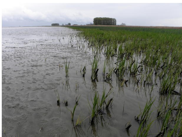
Freshwater part of the Elbe river at Krautsand (Germany), with Bolboschoenus maritimus beds on the shores.

C2.4 Tidal river, upstream from the estuary