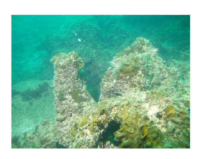
Massive serpulid reefs with bivalves Ostrea edulis, Mytilus galloprovincialis and Petricola lithophaga on lower infralittoral rock, Maslen Nos, Bulgaria.