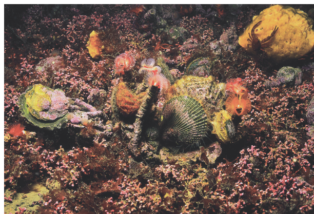
A bed of Lithothamnion corallioides with flat oyster, queen scallop, serpulid worms and a wide variety of sponges. Keraliou bank, Bay of Brest, France.