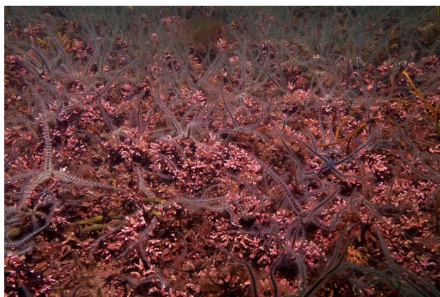
A bed of Lithothamnion glaciale surrounded by brittlestars in Loch Sween, Scotland.