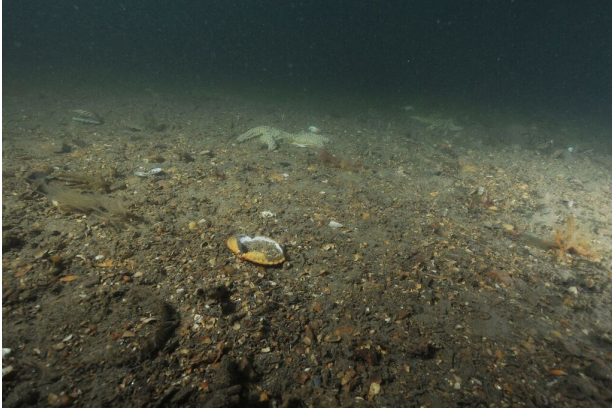
Atlantic lower circalittoral mixed sediment. West Hoe, UK.