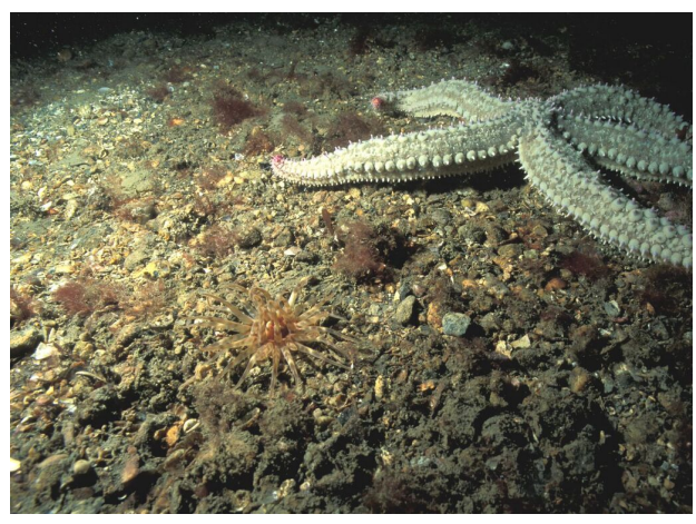
Seabed of coarse sediment in the upper circalittoral zone. East of Lundy Island