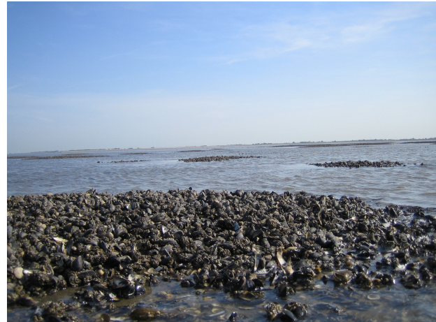
Intertidal mussel bed in the Waddensea, Netherlands.