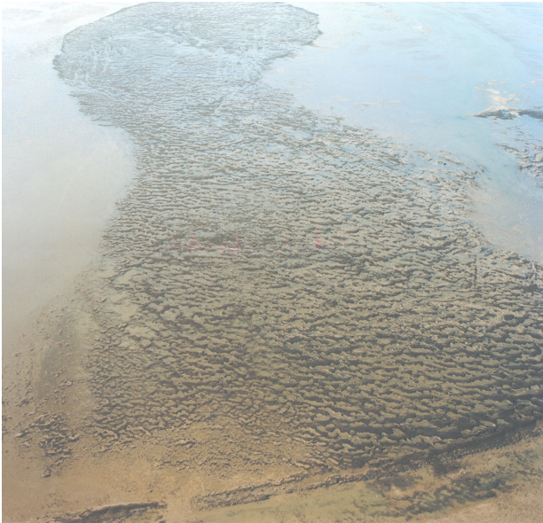
Aerial photograph of mussel beds at low water in the Waddensea, Netherlands.

A2.72: Mussel beds in the Atlantic littoral zone