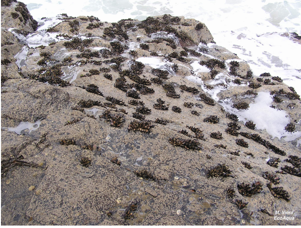
Mussel and barnacle habitat on the exposed north eastern coast of Fuerteventura, Canary Islands (© M. Viera, EcoAqua).