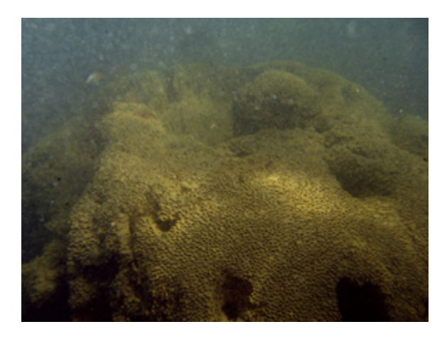
Sabellaria spinulosa reef from Torre Mileto Adriatic Sea.