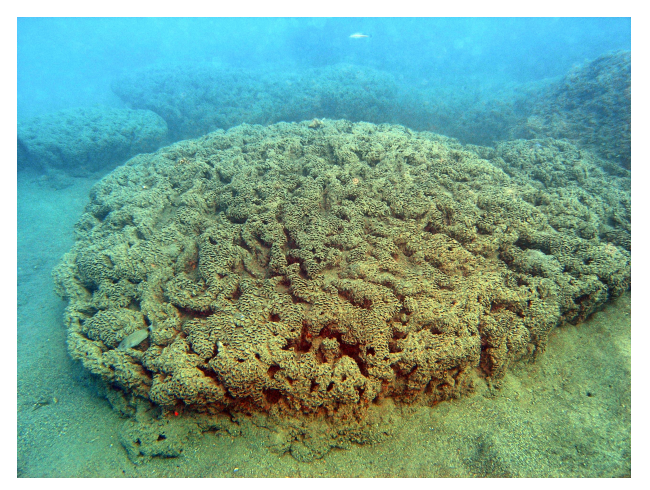
Sabellaria alveolata reef from the eastern Liguria Riviera