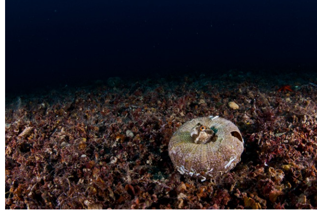
Rhodolith beds in the Aegean Sea.