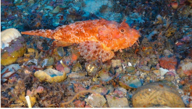
Scorpion fish and maerl bed. Oceana expedition to the Balearic seamounts onboard the SOCIB R/V. Fort d'en Moreu, Cabrera, Balearic Islands, Spain.