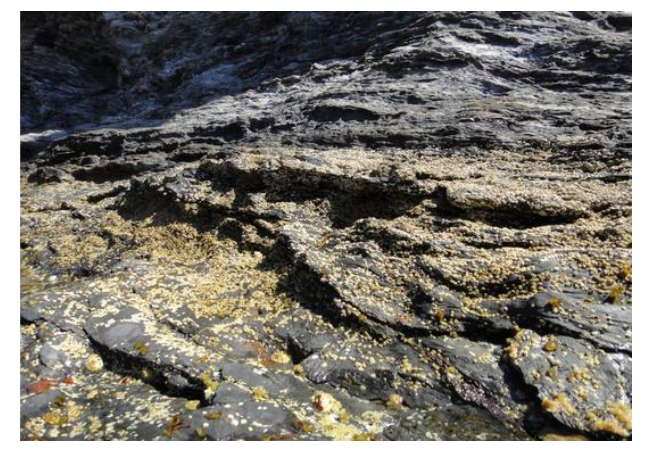
Upper mediolittoral rocks with Chthamalus spp along the Italian coast.

A1.13: Communities of Mediterranean upper mediolittoral rock