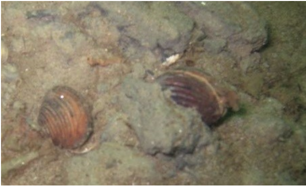
Astarte spp. on muddy sediments.