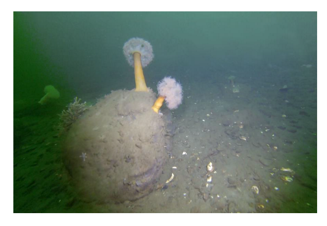
The sea anemone, Metridium senile growing attached to a rock on mixed substrate.