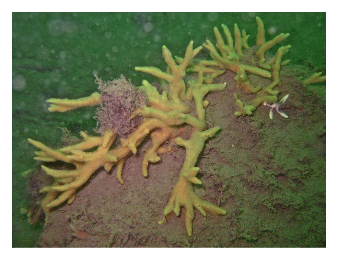
Erect growing branched sponge ( Haliclona oculata ) attached to a boulder.

Epifaunal communities on Baltic circalittoral rock and mixed substrata (predominantly hard)