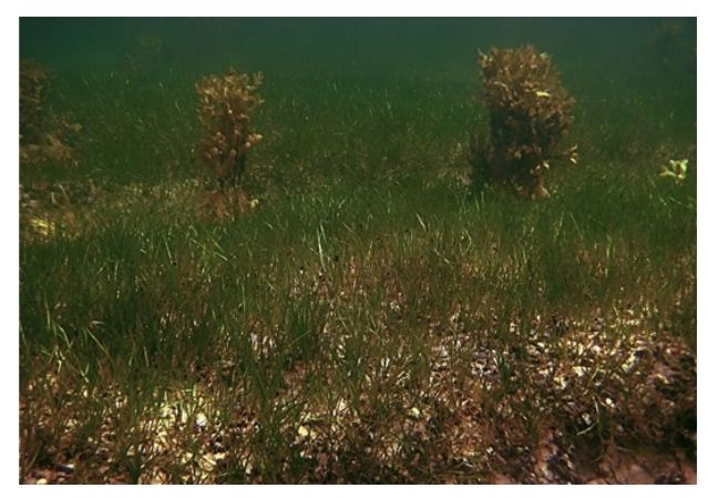
Baltic photic mixed substrate dominated by the common eelgrass, Zostera marina.

Submerged rooted plant communities on Baltic infralittoral mixed substrata (predominantly soft)